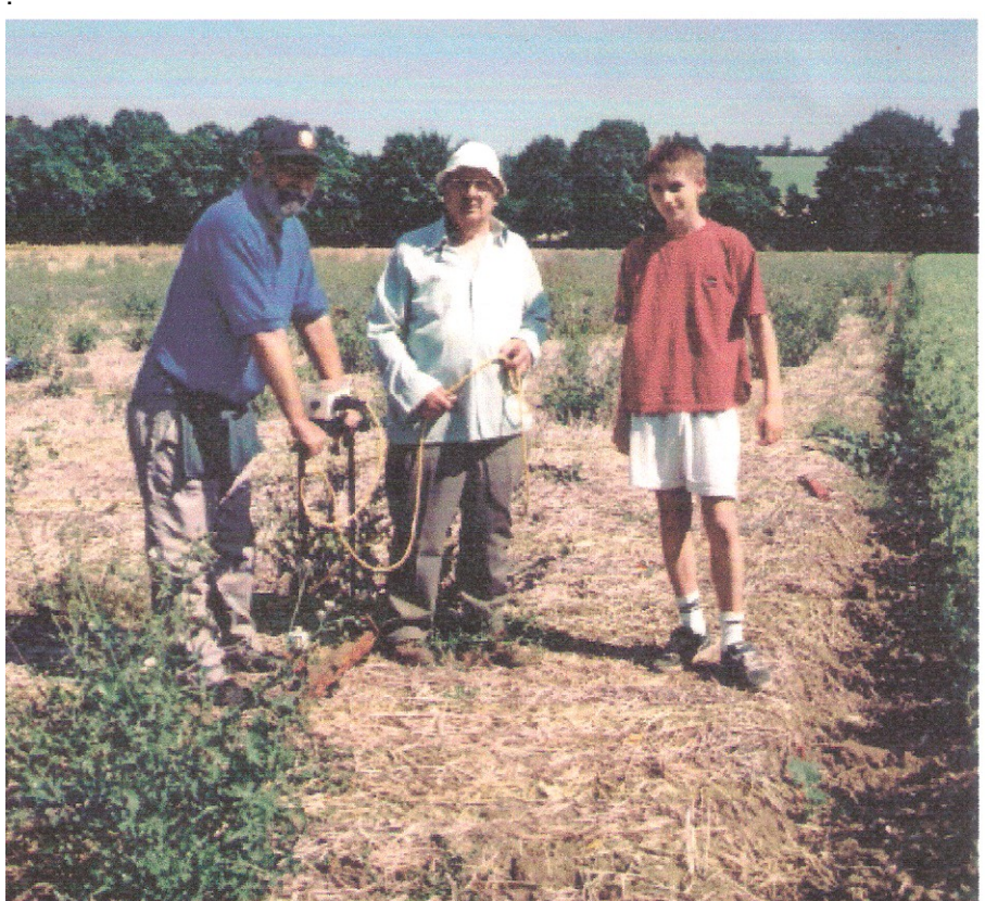
Resistivity at Lenham Community Centre site ...when LAS was first started!

The site obviously had a lot of activity in the past . A midden of oyster shells was detected about were these members are standing and were found again in the Groom Way dig . A Bronze Age arrow head was found in this same area :-