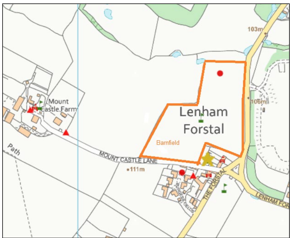
The Post Code is ME17 2 JD

A Neolithic stone axe had been found in the garden of a cottage at the Forstal, gold star on this map.