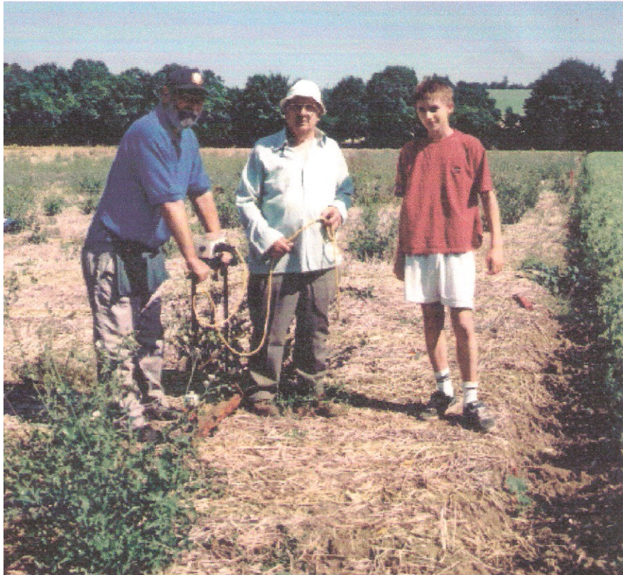
Resistivity at Lenham Community Centre site ...when LAS was first started !

The site obviously had a lot of activity in the past . A midden of oyster shells was detected about where these members are standing and were found again in the Groom Way dig . A Bronze Age arrow head was found in this same area :-