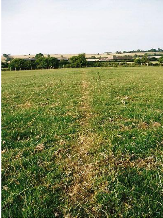
parch mark of drain looking north to the Cross on the hill.

The resistivity survey (using a machine that registers the resistance and therefore the hardness of underlying soils) showed the farm road across the eastern edge of the field.