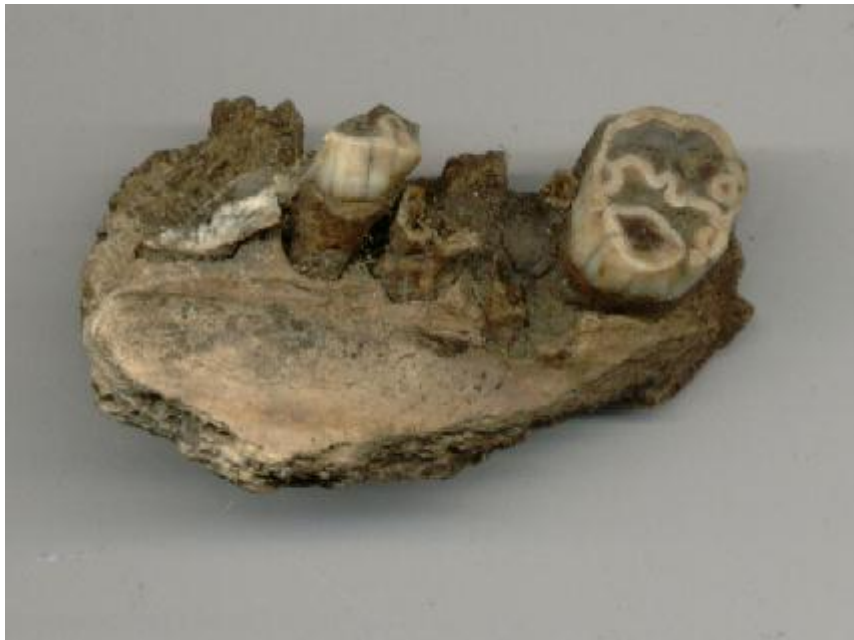
Sheep jaw bone from Stumbles Field- associated with IA sherds