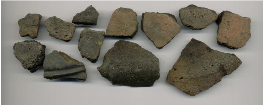
Late Iron Age Grogware sherds from Stumbles field.