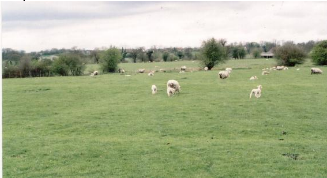
Stumbles looking west, showing some of the ditch marks.

When flying across East Lenham in the Spring of 2005 , I clicked the shutter on the farm House and moat .... but I was surprised to see features so clearly in Stumbles Field to the west of the moat. On several older aerial photographs there were vague lines but this particular day they showed quite sharply. On ground level the field is seen to have two divergent banks that splay out in a triangular form and according to the Barr family that own it, these banks have always been there. Certainly no ploughing has taken place in modern time and the field is shown as pasture on the 1660 map. Our investigations show that it could have been sheep pasture 2000 years ago..... almost exactly as it is now .