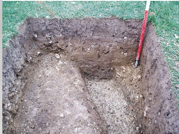
Flint tempered sherds